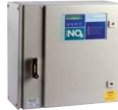
The Salwico emissions monitoring system by Consilium.

Consilium produces analysis and monitoring systems such as the Salwico EMS, a continuous monitoring system for NO x , SO x and CO 2 ; the Salwico G1000, an opacity monitor for the smoke density of engine emissions; the Salwico G2000, an ambient oil mist detector for engine rooms; and the Salwico G36, an oxygen analyzer that controls the content of O 2 in inert gas.