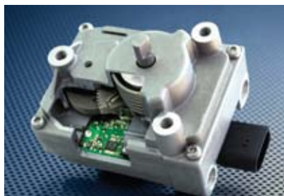
Sonceboz's BLDC actuator for controlling emissions in large diesel engine applications.

This BLDC actuator features integrated CANbus control electronics and can operate in a supply voltage range between 9 and 32 V. In the event of power failure and in order to prevent malfunctions, an integrated return-to-zero spring is included. The fail-safe position is customizable, the company said.