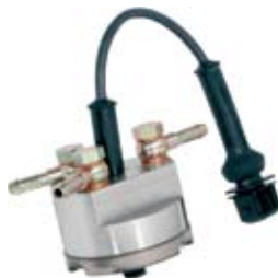
A single dosing and injection unit by Heinzmann.

The company has also launched a new dosing unit for burner feed or direct injection into the exhaust system with fuel or urea. Along with that, the entire product range has been updated with a new leakage-safety valve system.