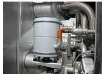
The UT99 oil mist eliminator for closed-crankcase ventilation in gas engines.

UT99 has been producing oil mist eliminators since 1969. The oil mist eliminators are used in gas and diesel engines as well as turbines, compressors, gears and generators.