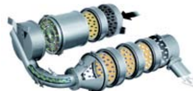
The HJS SCRT system is designed to retrofit Euro 3 city buses to comply with Euro 5 and EVV emissions standards.

HJS has developed an aftertreatment system for critical applications with lower exhaust gas temperatures. To ensure regeneration or dosing during engine operation, HJS has developed a burner technology for OEM use and also for the upgrade of existing Stage 3a engines to Stage 3b.