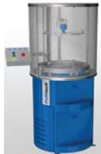
The Puriclean modular cleaning unit from PuriTech.

The Purimobil unit is a closed catalytic-coated filter with an additional prefilter. It has a 99.99% PM efficiency while reducing NO x emissions, said PuriTech. The filter does not use an additive or extra fuel injection, PuriTech said, providing lower maintenance and overall costs.