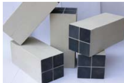
The porous silicon carbide substrate from LiqTech.

The LiqTech DPF is a wall-flow filter made of porous silicon carbide in a honeycomb structure. It is produced in ranges from 90 to 250 cpsi in any required shape or length, LiqTech said.